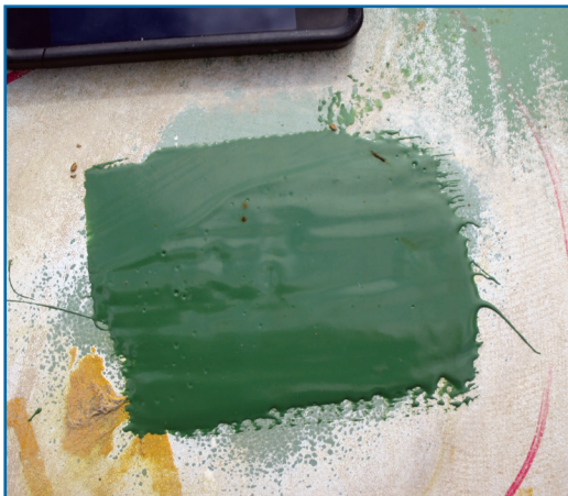
Tiny holes in the patching indicate uneven application of field coating, which can partially expose the area that had been repaired.