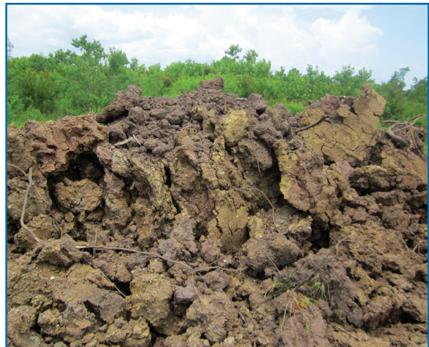
The good black topsoil and the underlying yellow substrate are comingled on this landowner's property near Beaumont. When replaced over the trench, this mix will not support valued agricultural plant life.

The code of construction requires good right-of-way reclamation practices for ground disturbed during construction. 55 Good construction practice requires that excavated topsoil be kept separate from the subsurface materials, so that when the pipe is finally covered up, the arable topsoil can be once again placed atop the ground's surface to ensure plant and crop growth. 56 On David Holland's property, and on other properties, the darker topsoil appears to have been comingled with the lighter sterile subsurface clays. If the arable and substrate soil shown in this picture is used in this mixed form to cover the trench, the farmer or landowner will have difficulties growing crops, pasture or other plant life in the same way as before the ground was disturbed. David Whitley has complained that the soil where the pipeline had been constructed will not grow grass as expected for grazing purposes. Instead, only plants of no agricultural value can grow there. Many other landowners have reported a similar problem.