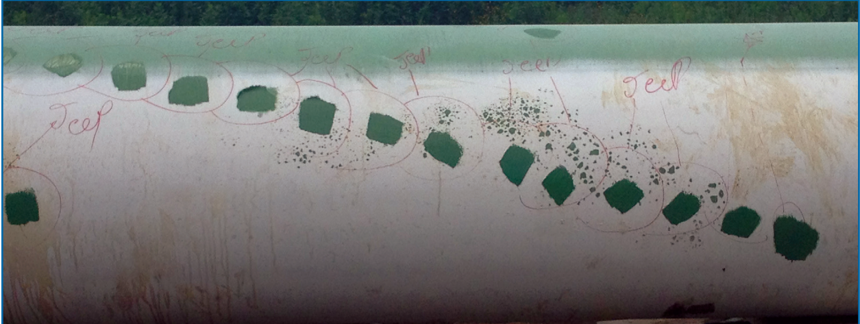
Patches have been applied to cover “holidays,” or holes and pipeline damage. Some of the patches are peeling before the pipeline is to be buried in the ground.