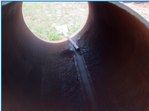
The two shots are of the exterior and interior of a massive dent from the inside of a pipe section near Jacksonville, Texas.