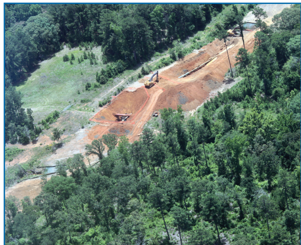
Top: Typical view of a remediation showing extensive pipe exposed near the city of Corrigan. Above: Area near Jacksonville showing a transition area at the bottom of a hill near a watercourse, where typically two thicknesses of pipe are tied, requiring technical welding skills.

Pipe replacements during excavation can easily be identified from the air where open trenches have two new bands of coating with a short pipe in the middle. Even when the site is buried, cut-out sections of the pipe are left on the property before they are collected. It is evident from the air that TransCanada has replaced many pipe sections in these sensitive transition areas, with resulting welds that are not required to be hydrostatically tested to ensure the pipeline's integrity.