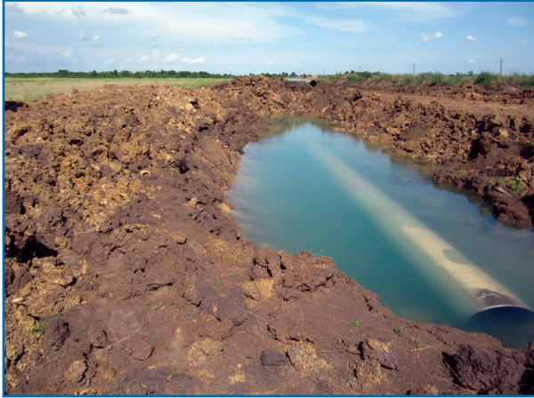
The pipe is not level in the ditch. The trench has collapsed around it on a construction site near Beaumont.