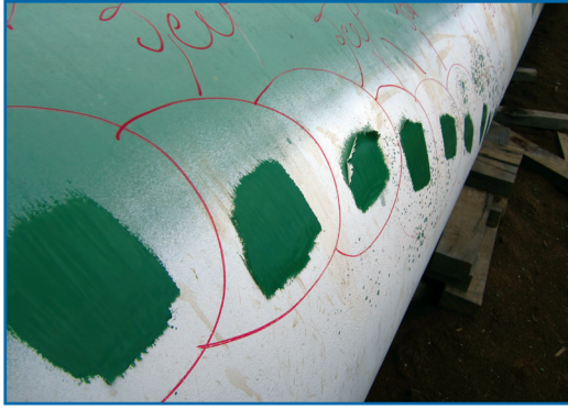
Close-up pictures of the repair patches, showing that the apparent lack of surface preparation before application of patching material has resulted in repair patches not adhering to the pipe. Pictured above some of the patches in this photo is the word "Jeep." A jeep is an electric tool used to detect pipeline abnormalities or holes.