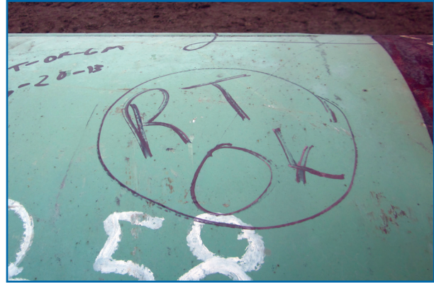
Proof that radiography testing (RT) was used during construction. This notation was seen on pipe on multiple East Texas properties.

The markings in the picture, and observed frequently in the field, indicate that RT was used to inspect the two new welds per each replaced pipeline section. RT is a less accurate technology. It is a process similar to taking a medical X-ray. 64 Once the welded pipe is in the ground, external examination is required so an X-ray is then taken from outside the pipe. With this process, the source used for the X-ray will expose both the top and bottom layers of pipe, and thus the weld can be twice the distance from the film, which significantly reduces radiographic quality. The radiography examiner will try to make a judgment on the safety of the welds based on this X-ray, which loses some clarity since it