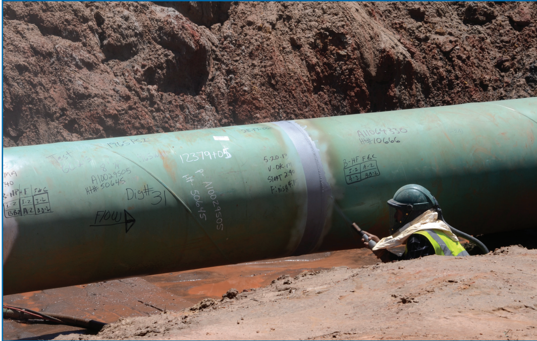
Workers in a trench are finishing the new replacement of pipe on a landowner's property.