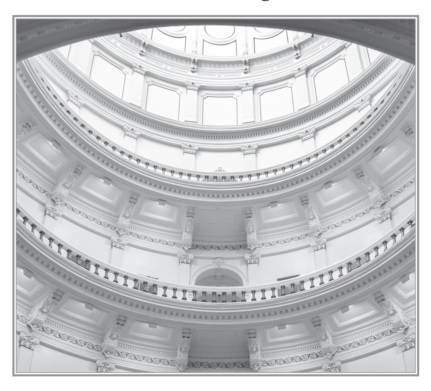
House Select Committee on Economic Competitiveness